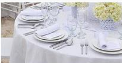
Reception Table Linen