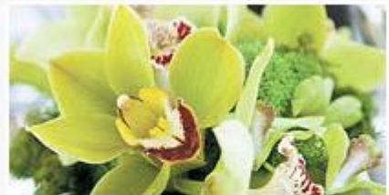
Reception Table Centerpiece