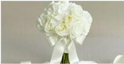
Bouquet And Boutonnieres

Make your wedding day as unique and special as your love by creating a totally personalized celebration inspired by you! You will find inspiration with our online Wedding Options catalog to customize the wedding of your dream. Visit http://www.beaches.com/weddingmoons to see all that Beaches WeddingMoons® has to offer.