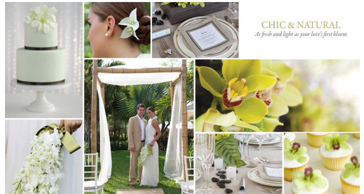
CHIC & NATURAL As fresh and light as your love's first bloom