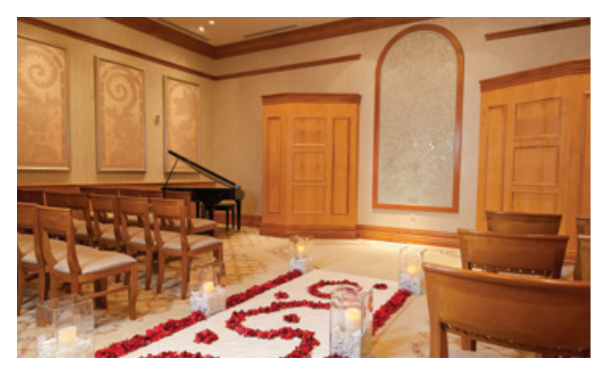
FLICKERING CANDLE DÉCOR Includes flickering candles, aisle runner and petals. $250